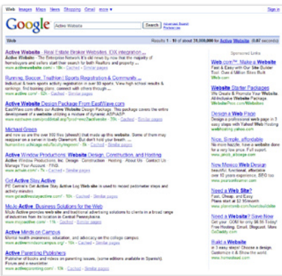
Google Search Results