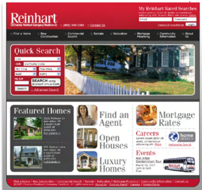
Charles Reinhart Company Realtors