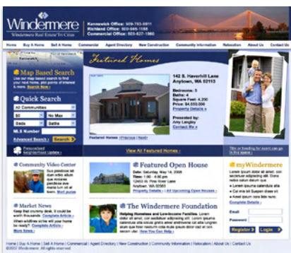
Windermere Tri-Cities Real Estate