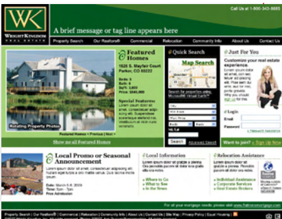
Wright Kingdom Real Estate