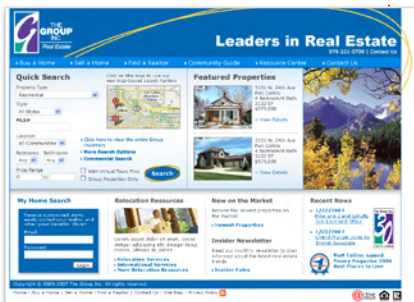
The Group, Inc. Real Estate