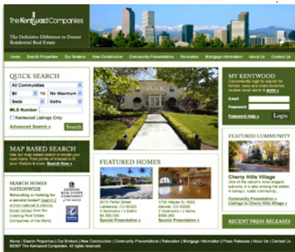
The Kentwood Companies

On an annual basis, we completely review the website to assure it is incorporating current technology trends and innovations. The site content, technology and visuals are revived, integrating the knowledge learned over the previous year. This yearly analysis ensures that first-time visitors always experience the best of the best in their online Real Estate experience, and returning clients are continually impressed.